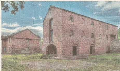
Wappenshall Wharf: a funding crisis could jeopardise restoration plans.

A spokesman said: "We are still pursuing other funding sources and, as mentioned above, we have appealed to our 1250 members to pledge their support – if even half of them pledge